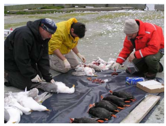
Processing subsistence birds

Some sample reduction can be accomplished while collecting and while on the boat. For maximum flexibility, 450 g should be collected from each fish, bird, or kelp (200 g for a Cs composite, 200 g for archive, and 50 g for actinide analysis). It is challenging to collect enough Blue Mussels for 1000 g samples, but it is important because it provides for an intermediate trophic level that is an Aleut subsistence food.