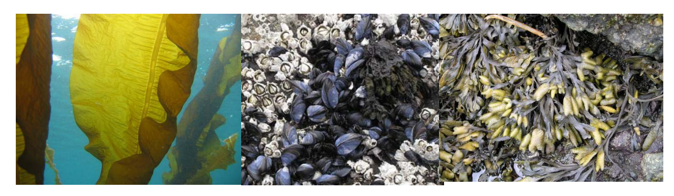
Alaria, Blue Mussels, Fucus

*Note: For Sea Lion, both muscle and liver were analyzed and had values above the MDA.