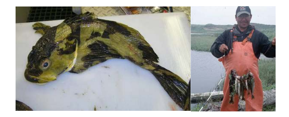
Table 3. Additional data on Cs-137 for some fish species reported previously, and for additional fish species. Given are the values in Bq/kg, wet weight. This table supplements table 11.5 in Powers et al. (2005).

Figure 5. Irish Lord, Dan Snigaroff holding Dolly Varden.