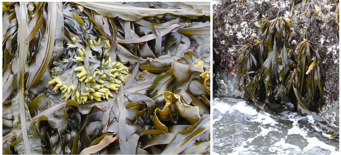
Figure 3 Fucus (left) and Alaria nana (right) growing in the Amchitka intertidal zone (photo J. Burger).

A second objective was to establish the best species for sampling sessile organisms to improve local exposure sampling in the intertidal areas. Hence CRESP decided to increase the number of analyses of Rock Jingles, and to analyze for the first time its samples of Blue Mussels (intertidal, subsistence food) and Horse Mussels (benthic, not usually accessible for subsistence). The data are presented in Table 2. We had initially added Horse Mussel because, as a benthic organism, we wanted to determine whether it was a better accumulator of radionuclides than Blue Mussel. There were no detects for Pu-238, and only one for U-236. While there were some significant differences (Horse Mussels had the highest levels), the differences were not great, and were probably not significant biologically.