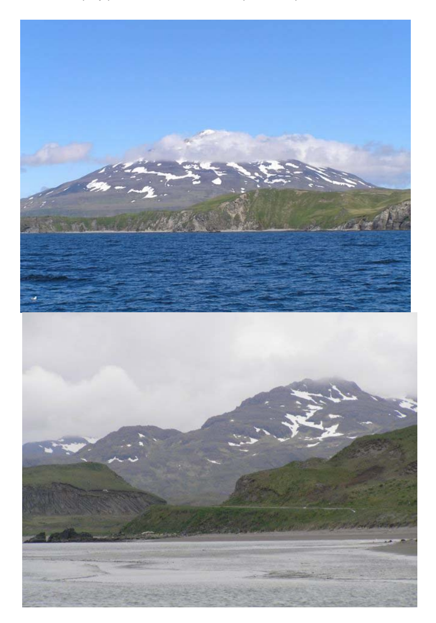
Figure 6. Kiska Island (top), Amchitka Island (bottom)

There were no differences in either the percent above the MDA or the mean levels for Cs-137 in fish from Kiska and Amchitka (see table 5).