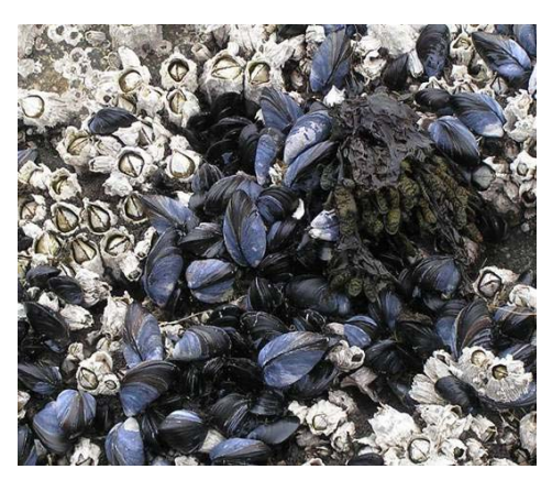
Figure 4. Blue Mussels from intertidal rocks near Amchitka test shots

a. This difference is due to one high outlier, suggesting that this difference is not biologically significant.